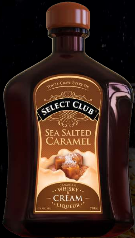
SELECT CLUB SEA SALTED CARAMEL CREAM

Rich sweet cream, followed by toasted oak notes, finishing in a sweet and subtly salty butter caramel