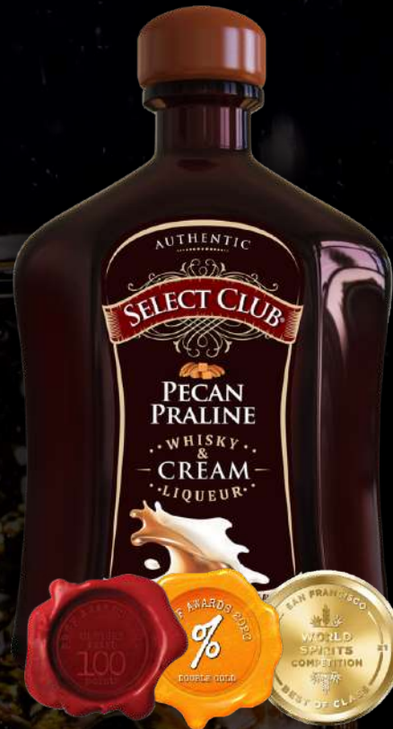
SELECT CLUB PECAN PRALINE CREAM

Juicy notes of fresh green apple blend with the sweet cream and warm whisky followed by lingering sweet caramel