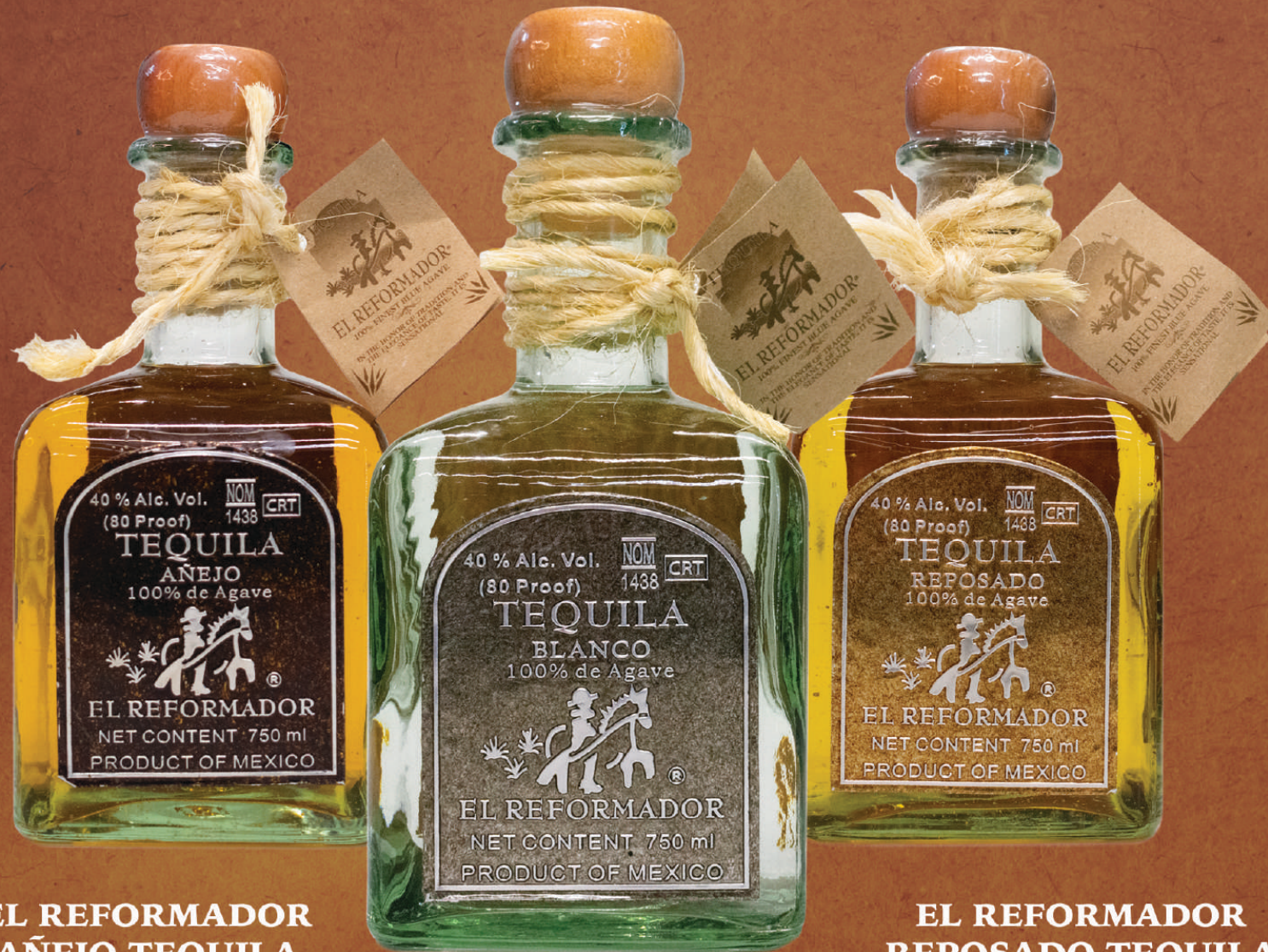
EL REFORMADOR AÑEJO TEQUILA