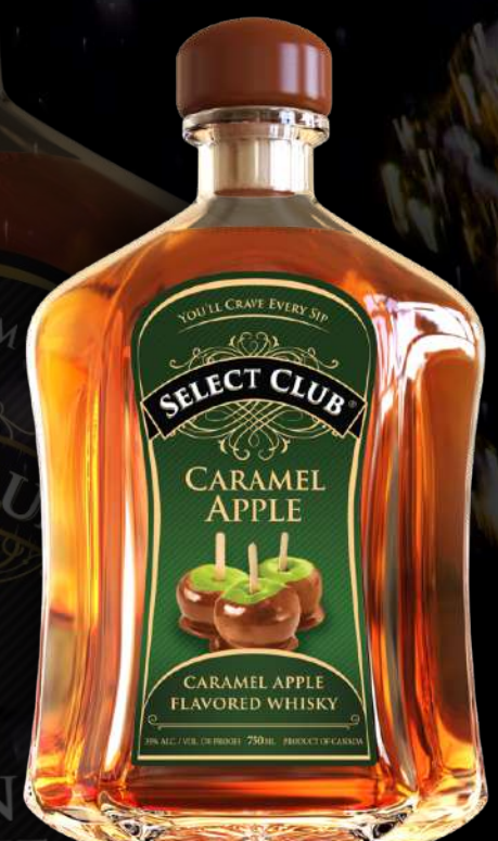
SELECT CLUB SOUTHERN PEACHES & CREAM

The Select Club Whisky you've come to know and love enhanced with rich, buttery salted caramel and vanilla flavors.