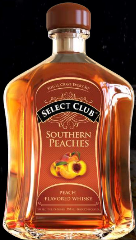
SELECT CLUB SOUTHERN PEACHES WHISKY

Fruity, fresh notes of juicy, ripe peaches. Adds the perfect twist in a classic southern sweet tea.