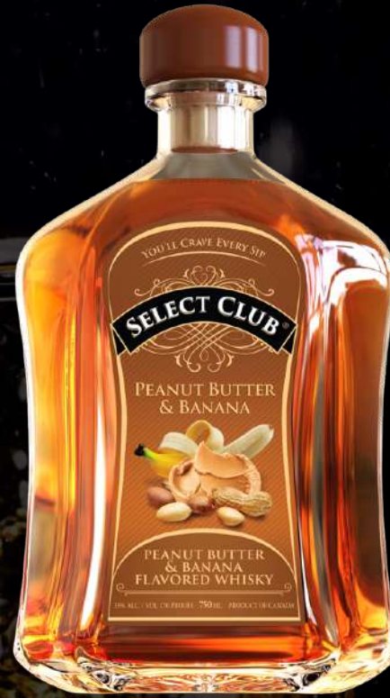
SELECT CLUB PEANUT BUTTER & BANANA WHISKY

This buttery pecan, caramel treat is a national favorite. Not overly sweet, with a beautiful pecan aroma.