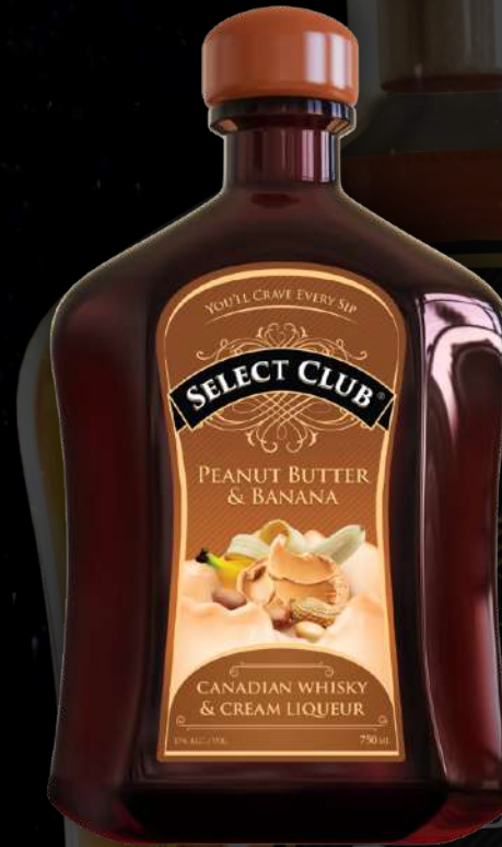
SELECT CLUB PEANUT BUTTER & BANANA CREAM

This unique, authentic spirit is one of the 1st of its kind in the market. The perfect blend of whisky & cream.