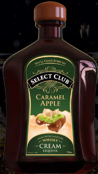
SELECT CLUB CARAMEL APPLE CREAM

Rich sweet cream, followed by toasted oak notes, finishing in a sweet and subtly salty butter caramel