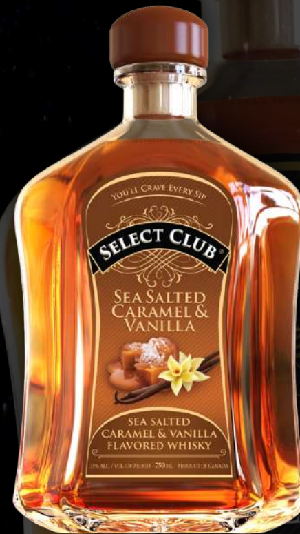
SELECT CLUB SEA SALTED CARAMEL & VANILLA WHISKY

A ridiculously rich and flavorful whisky with notes of silky roasted peanut butter and a sweet fruity banana finish.