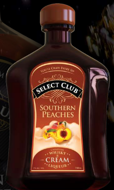
SELECT CLUB SOUTHERN PEACHES & CREAM

Rich & sweet, notes of rich peanut butter and warm whisky, finishing with lingering sweet banana notes