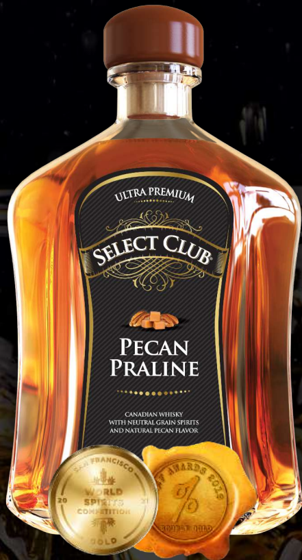
SELECT CLUB PECAN PRALINE WHISKY

Fruity, fresh notes of juicy, ripe peaches. Adds the perfect twist in a classic southern sweet tea.